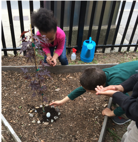
Adding organic soil to the tree we planted and making wishes for the Earth